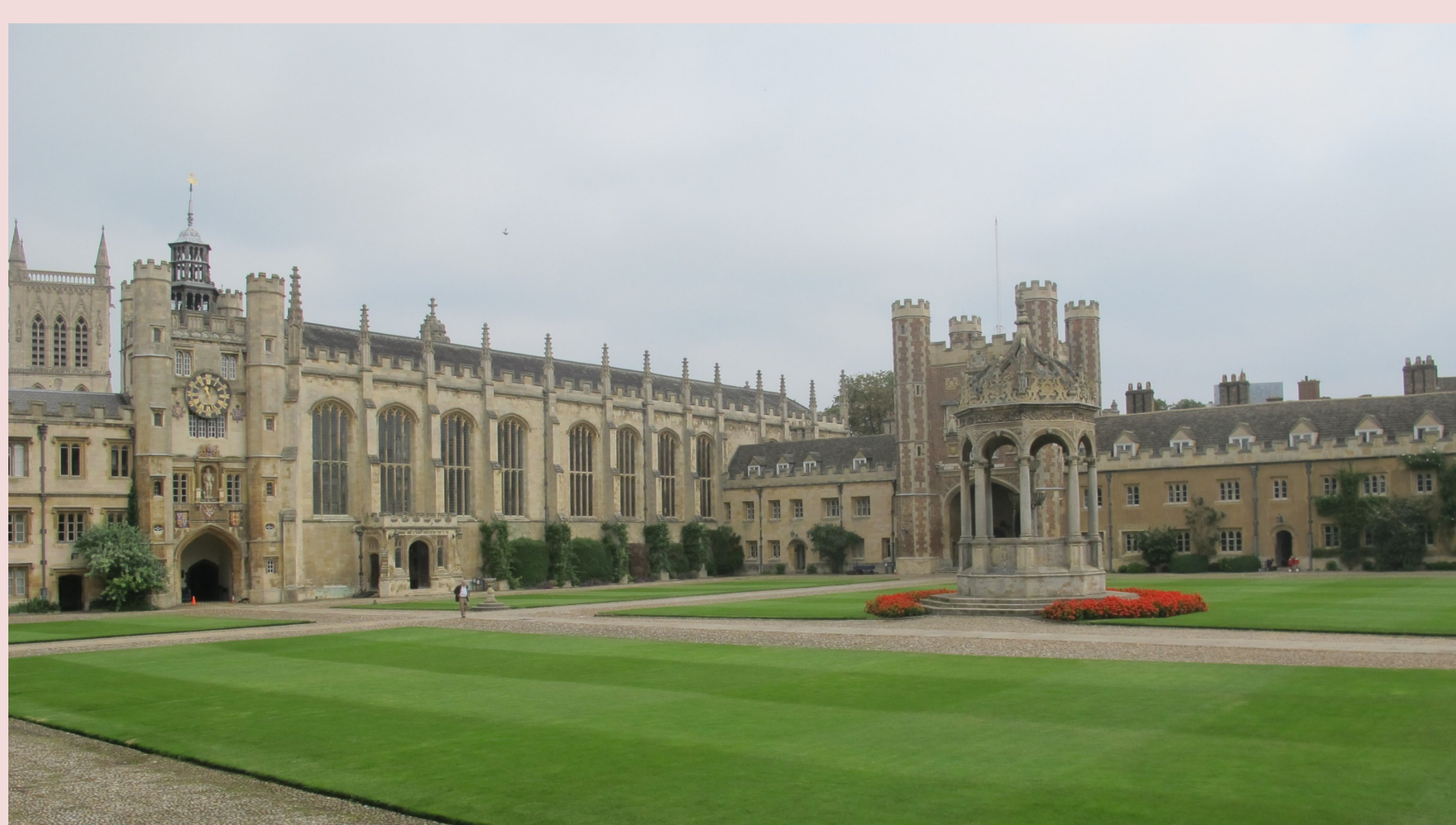
The Great Court at Trinity College, Cambridge, where Maxwell studied for most of his Cambridge days