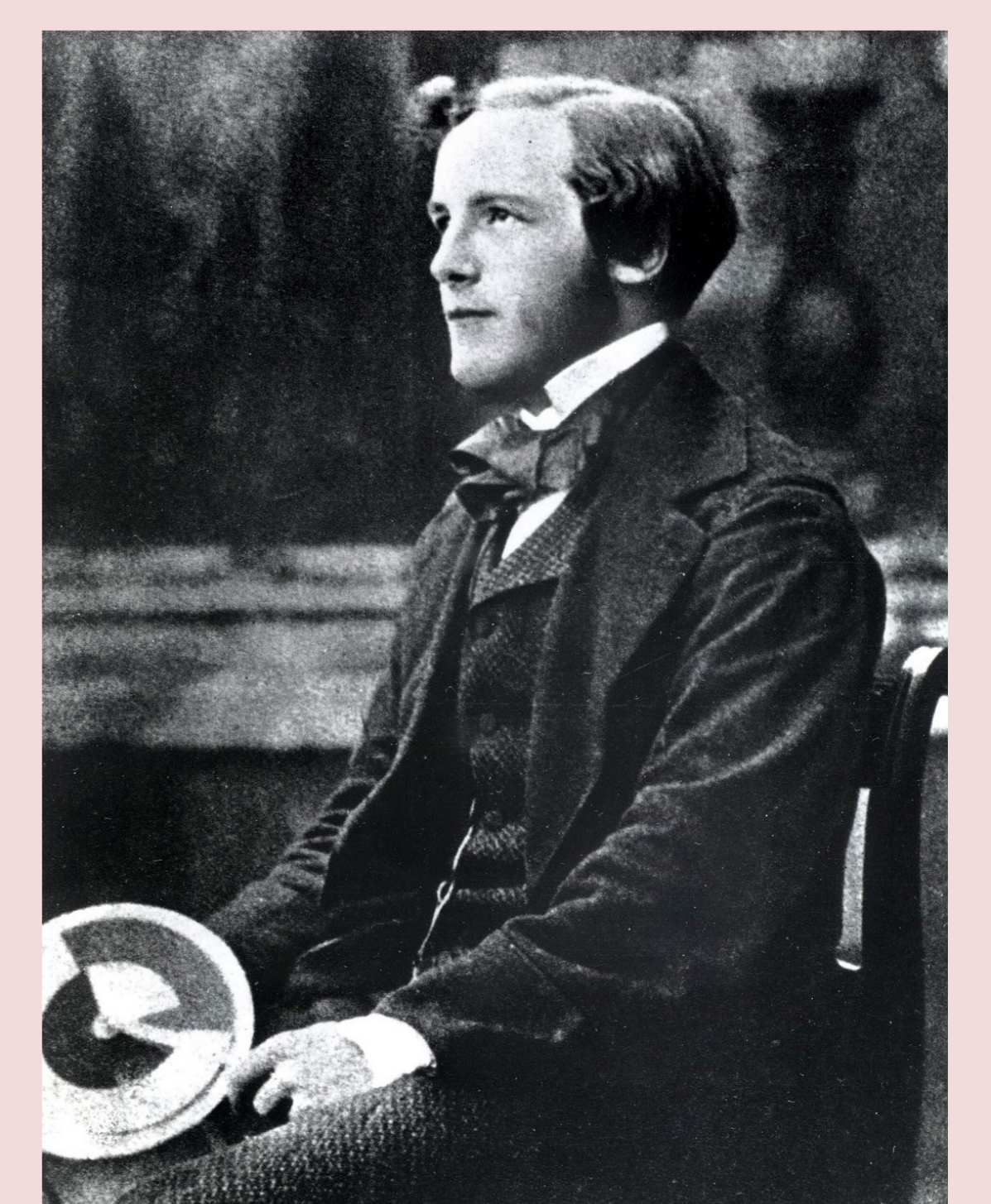
James Clerk Maxwell, aged 24