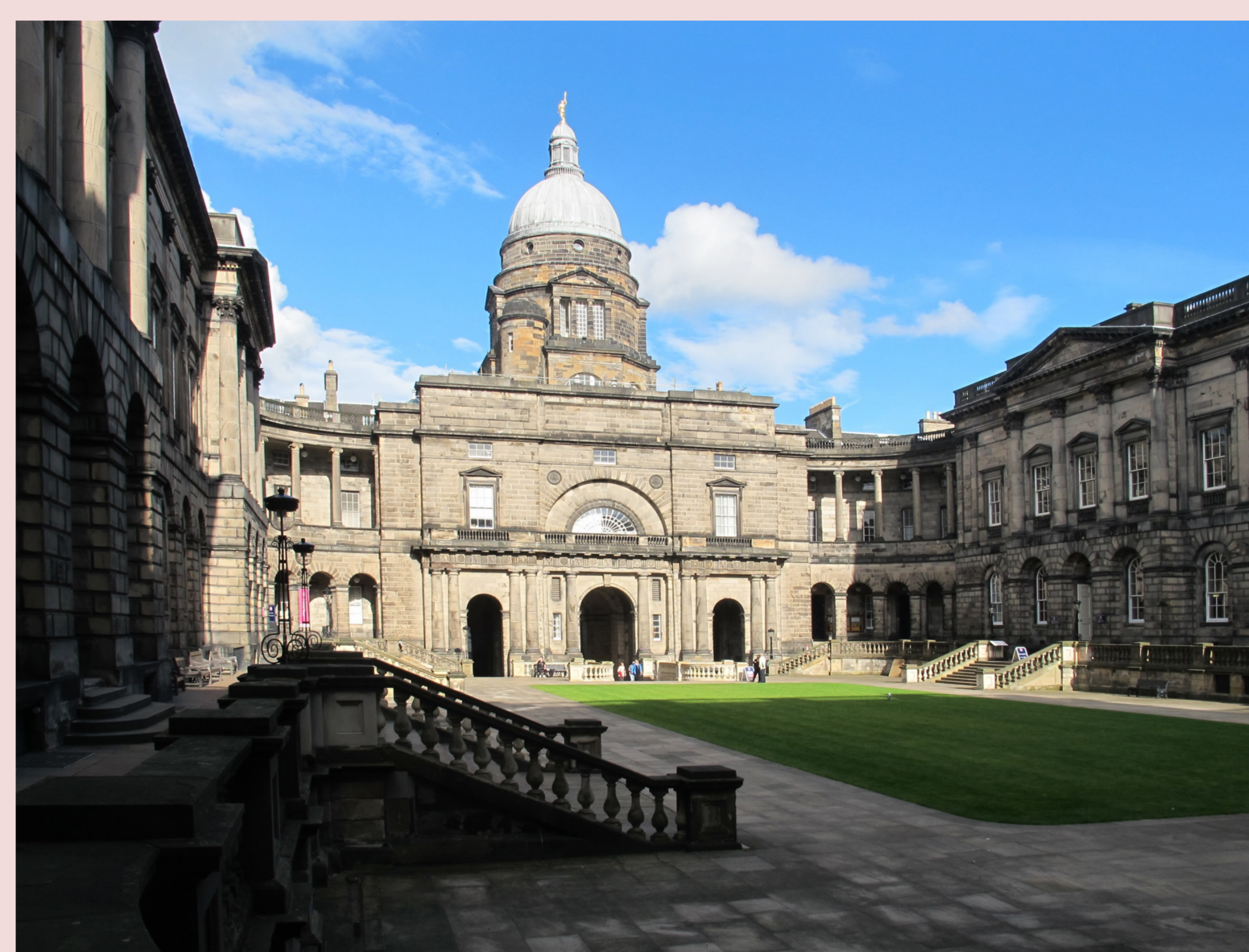
'New College', Edinburgh University, where Maxwell studied